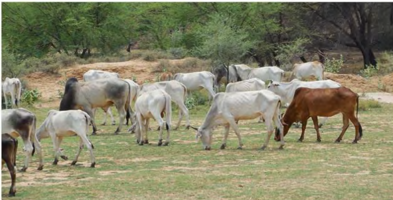
Fig 1.2 Potential for Biogas Energy

On the basis of Purchasing Power Parity (PPP), South Asia energy intensity is lower than the world average, including the United States and China. Energy intensity is based on commercial fuels. These low numbers also reflect a high proportion of non-commercial energy, e.g., traditional biomass, etc.