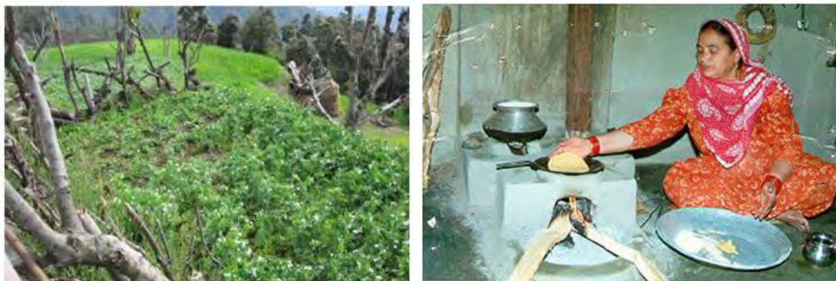
Fig 2.1 Smokeless Stoves and Organic Gardening are part of the Eco-Village Development Concept

The Eco-Village Development concept involves the implementation at village-level of appropriate, inexpensive renewable-energy technology (RET) and capacity-building activities for climate-change adaptation and mitigation. It takes a collaborative approach by involving community members deeply in planning and implementation, while also giving them the tools to be resilient while facing climate change. EVD is an integrated approach of creating development-focused, low-carbon communities of practice in existing villages. The bundle of practices includes mitigation technologies like small, household-sized biogas plants, smokeless stoves, solar-energy technology, improved water mills to generate electric power, stand-alone systems like pico-/micro-hydro power for rural electrification, and solar-powered drying units. It also includes adaptation technologies such as organic farming, roof-water harvesting, water-lifting technologies like hydraulic ram pumps, and other solutions.