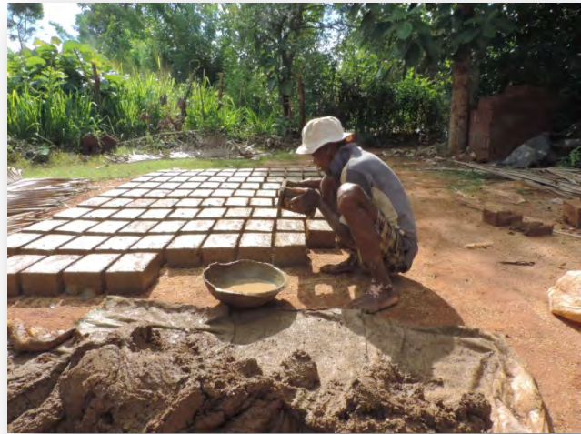
Fig 5.3.1 Dharmaratne making bricks with rice husk brick mixture

IDEA trained Mr. Dharmaratne in making a brick mixture using rice husk. They also shared with him a technique for better brick-kiln stacking, leading to a more efficient production process, and taught him brick-firing processes using rice husk. They first collected and analyzed clay samples from the area where Dharmaratne collected brick-making clay. After determining the mix of clay, sawdust, and/or paddy husk in the clay, IDEA experimented with various mixtures of clay and rice husk to compare them for quality and feel. They then trained him on the ideal mixture to use. IDEA helped Dharmaratne to upgrade his kiln from the inefficient, fuel-intensive, and wasteful temporary kiln that he was using to a permanent brick kiln. This new kiln has permanently constructed walls at three sides, a roof, and three firewood openings. Importantly, both firewood and rice husk can be used as firing fuels. This kiln also has additional firing channels. With the upgraded procedures, the stacking of bricks inside the kiln is done systematically with interlayer gaps to be filled with paddy husk to improve the heat circulation and to get the maximum heat benefit. The improvements in the brick kilns has reduced the consumption of firewood substantially, creating additional economic benefits for brickmakers such as Dharmaratne while also reducing tree-felling for firewood. This, in turn, has eliminated