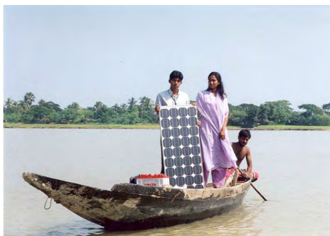
Fig 1.3 Solar Technology for Island Dwellers in Bangladesh

These challenges can be met by increasing energy efficiency through innovations in technology and processes, as well as by increased use of renewable energy, resulting in lower emission increases and eventually, in emission reductions.