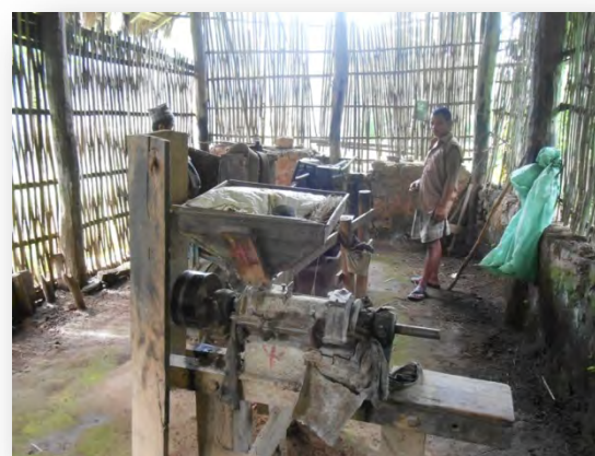
Fig 5.4.8 Rice huller integrated with IWME