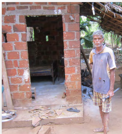
Fig 4.4.2 Dharmaratne

There is immense potential for replacing conventional materials with bio-waste for many small and medium-scale industries in Sri Lanka.