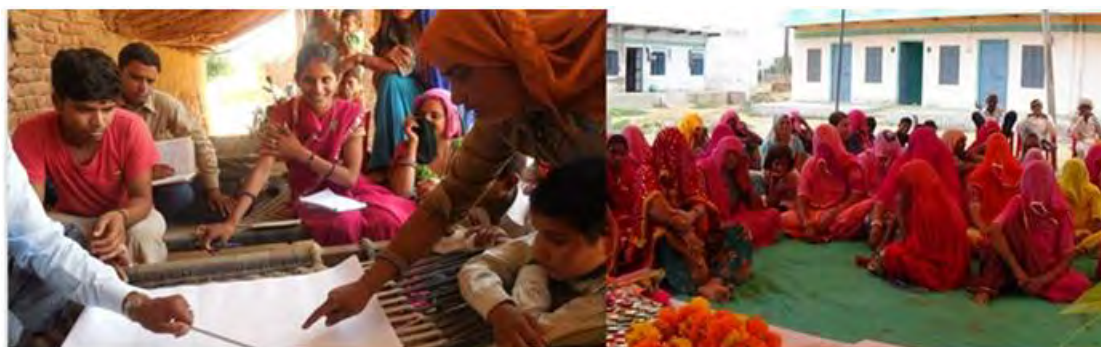
Fig 2.3 Active participation of villagers in project development in India

The key to success for any development project is the active participation of local communities, sub-communities, and rural households.