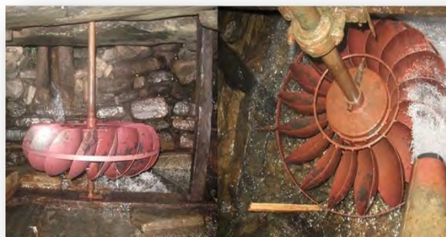
Fig 5.4.4 Improved water mill

The Improved Water Mill technology complements the essence of the eco-village development concept. Not only is it a source of clean energy, it also has cobenefits that can enhance rural livelihoods. It is ideal for the hilly terrain of Nepal, which has plenty of water resources and enough height for the system to work. Over the last few decades, many changes have been made to the technology, making it more efficient, time-saving, and versatile in use. The Center for Rural Technology, Nepal (CRT/N) has implemented an enhanced version of the technology, known as the Improved Water Mill Electrification (IWME) system. This is being used for rural community electrification and to integrate micro-enterprises that use electricity generated from IWM. Importantly, much training on income-generation solutions is also integrated into the programme.