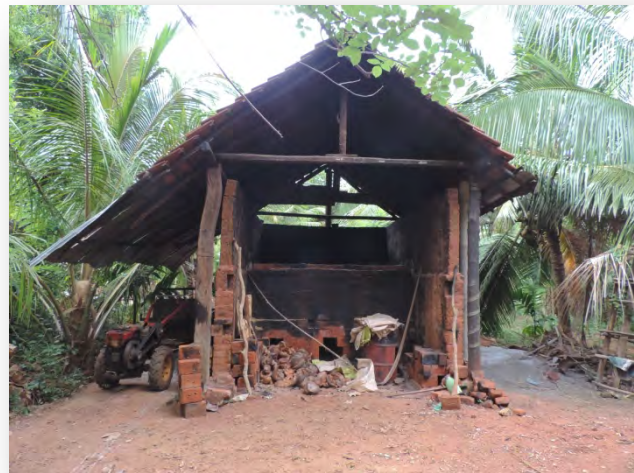
Fig 5.3.2 Dharmaratne's improved and permanent brick kiln