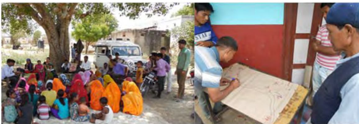
Fig 3.1 Villagers meeting and roadmap planning for policy makers