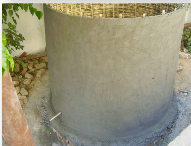
Fig 5.2.6.1 and Fig. 5.2.6.2 Bamboo-cement based rain water storage tank under construction