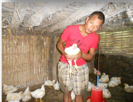
Fig 5.4.5 and 5.4.6 IWMEChicken houses and Chicken Man