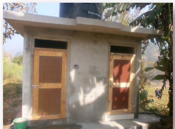
Fig 5.4.3 Toilet and water tank built after Hydram installation