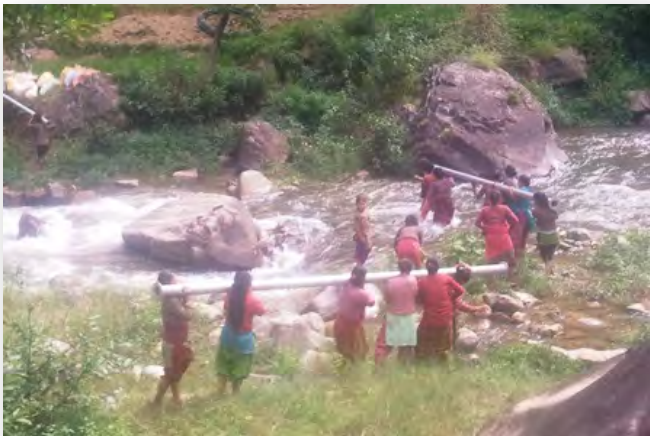
Fig 5.4.2 Women's contribution towards the implementation of the hydram project

The collective impact of this development has been felt the most in the status of women in the Nepalese community at Sanigaun-5, Balthali. Not only has the project improved women's communication skills, it also has given them greater confidence, leadership, and decision-making capacities.